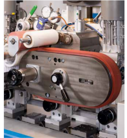
Printing units with belt pad

The capacity of the CONTINUOUS CIRCULAR, depending on the parts to be printed, amounts to up to 15,000 parts/hour.