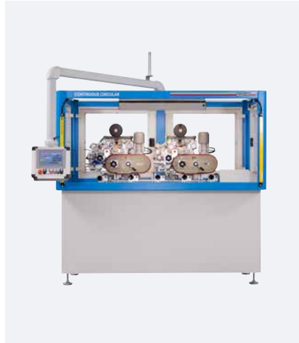
CONTINUOUS CIRCULAR with 2 printing units

The CONTINUOUS CIRCULAR is both available as single-color, as well as multi-color pad printing machine. With this innovative pad printing