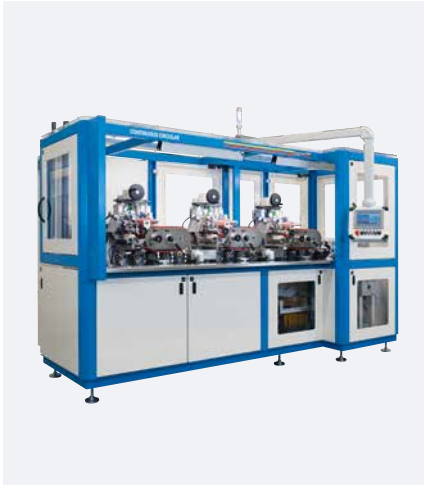
CONTINUOUS CIRCULAR with 3 printing units

The CONTINUOUS CIRCULAR with its 360° rotary printing process convinces through its registration accuracy for an enhanced process control and herewith accompanying for a better quality and higher precision, compared to conventional pad printing solutions.